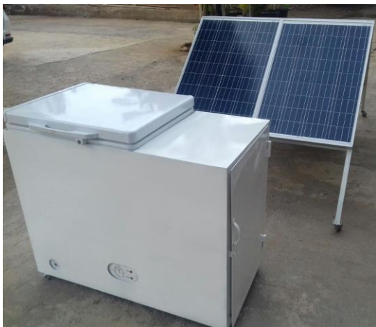
Fig. 3. Cold Storage Solar Cell for fisherman

The availability of Inflated Portable Cold Storage House technology Prototype with Solar Cell which has speed and effectiveness in the process of transportation, assembly, installation, dismantling, tested thermal comfort (temperature, humidity and air pressure) and tested in Lab and Field is needed for Fisherman.