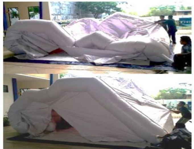
Fig. 1. Setting-Up Process of Inflated Portable Structure