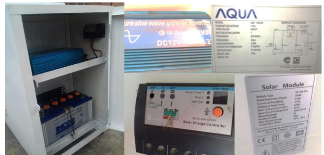
Fig. 5. Cold Storage Solar Cell specification for fisherman