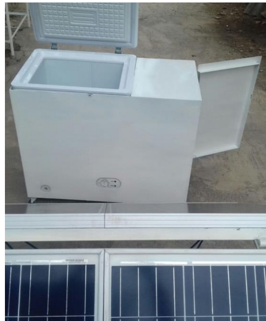
Fig. 4. Cold Storage Solar Cell Details for fisherman

Placement Inflated Portable Cold Storage House is flexible, it can be in residence / housing so it can be applied to the urban community. Technology of Inflated Portable Cold Storage House with Solar Cell has high prospects for mass-manufactured by Industrial Partners, due to the high demand for fresh fish urban and inadequate availability of hygienic fish production, but cheaper.