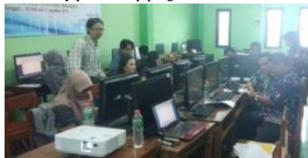
Figure 1 Training Situation in the Computer Laboratory Room

The Training Program for NU Vocational High School Teacher Statistics in Sidoarjo Regency was held from July 25 to August 31, 2018, which was held in partner computer laboratories with good results. This is evidence, impressions and remarks from all the teachers who attended the training and mentoring program during the implementation of community partnership program.