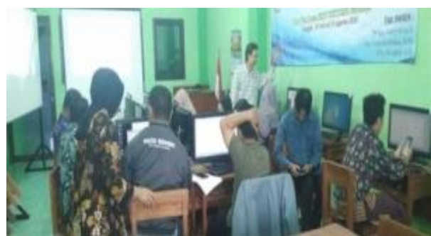
Figure 2 Assistance in training that is being carried out by resource persons