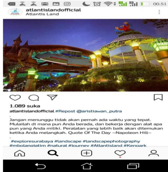
Figure 1: Instagram of Atlantis Land Official

Instagram aimed at promoting a worthy cause can lead to a higher good. Sharing event images and videos can help followers feel like they're in the action and are a real part of the community. Hashtags used by PT. Granting Jaya as an effective tool to make the name of Atlantis Land Surabaya become more viral and famous as a current issue in the city of Surabaya, especially in the tourism sector.