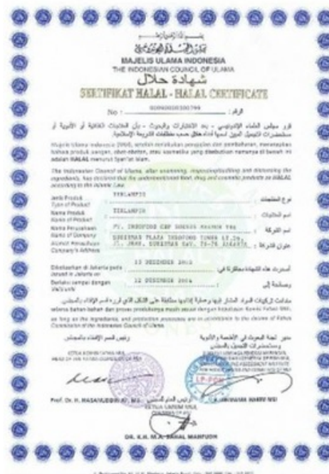
Picture 2. The MUI Halal Certificate

Meanwhile, from the perspective of the cosmetic manufacturers, the Halal Cosmetics Certificate is Important because is is the guarantee for the consumers that their cosmetics or pharmaceutical are lawful and allowed to be used and or consumed by Muslims who, in their understanding, really require halal products in their life. Using only halal things in life for Muslim is, in industrial players opinion, a thing that cannot be bargained. So, it can be said that both the consumers and manufacturers believe in the importance of halal status of products. Unfortunately, many suggest that the procedure for applying