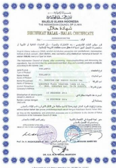
Picture 2. The MUI Halal Certificate

Meanwhile, from the perspective of the cosmetic manufacturers, the Halal Cosmetics Certificate is Important because it is the guarantee for the consumers that their cosmetics or pharmaceutical are lawful and allowed to be used and or consumed by Muslims who, in their understanding, really require halal products in their life. Using only halal things in life for Muslim is, in industrial players opinion, a thing that cannot be bargained. So, it can be said that both the consumers and manufacturers believe in the importance of halal status of products. Unfortunately, many suggest that the procedure for applying