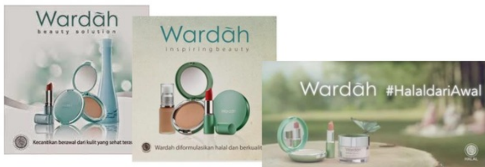
Picture 1. A series Wardah of Halal Product

Initially, Wardah produces a shampoo as their main product and it was quite successful as it became famous. Afterwards, Wardah saw a larger business opportunity and shifted to target Muslim segment. This is why Wardah gathered ingredients to make cosmetic products that uphold Islamic values which then branded as halal. Wardah Cosmetics has three principles, they are: (1) Pure and Safe, (2) beauty Expert and (3) Inspiring Beauty. In meeting the first principle, Wardah Products contain safe and halal materials that are formulated with consideration of the comfort and peace of the consumers. Wardah Realizes that Asian women's skin is different from European or American women's skin since the dermis (outer) layer tends to be thinner. This condition makes it more sensitive and susceptible to external factors. This very fact, only one fact, is already sufficient to become the foundation of