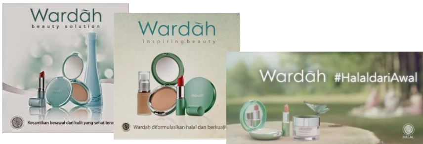
Picture 1. A series Wardah of Halal Product

Initially, Wardah produces a shampoo as their main product and it was quite successful as it became famous. Afterwards, Wardah saw a larger business opportunity and shifted to target Muslim segment. This is why Wardah gathered ingredients to make cosmetic products that uphold Islamic values which then branded as halal. Wardah Cosmetics has three principles, they are: (1) Pure and Safe, (2) beauty Expert and (3) Inspiring Beauty. In meeting the first principle, Wardah Products contain safe and halal materials that are formulated with consideration of the comfort and peace of the consumers. Wardah Realizes that Asian women's skin is different from European or American women's skin since the dermis (outer) layer tends to be thinner. This condition makes it more sensitive and susceptible to external factors. This very fact, only one fact, is already sufficient to become the foundation of