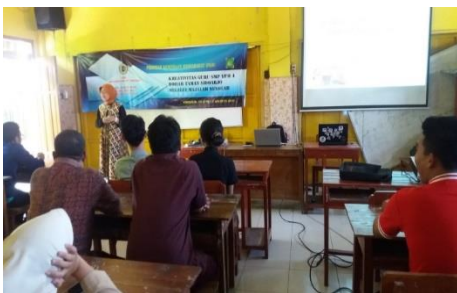
Figure 2. Photo of the leader of the service team giving training on article writing.

2. Article Writing Training aims to improve the skills and creativity of teachers in writing articles in the form of research results including the development and engineering and the results of thinking related to policies and problems in the field of education. The article text of an activity sponsored by a certain party must contain an acknowledgment containing the sponsor's funding information and a thank you to the sponsor. The manuscript has never been published in other media. The training material includes the contents of the article, the writing procedures, the ease and appreciation for the writers, the systematic writing, and the procedures for writing the reference library.