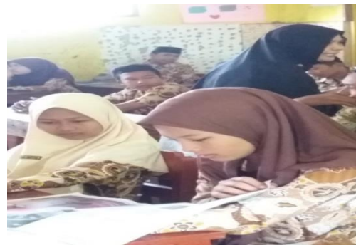
Figure 3. Photo of a member of the service team providing news writing training.

material covers the basics of news writing techniques namely news understanding, three news elements (events or events, reporters and readers), the news can answer the questions five W (What, Who, When, Where, Why) and one H (How), the nature of the news, news value, types of news, news sources , how to get news, and how to write news.