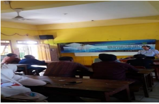
Figure 1. Photo of a member of the service team providing management training.

2. Article Writing Training aims to improve the skills and creativity of teachers in writing articles in the form of research results including the development and engineering and the results of thinking related to policies and problems in the field of education. The article text of an activity sponsored by a certain party must contain an acknowledgment containing the sponsor's funding information and a thank you to the sponsor. The manuscript has never been published in other media. The training material includes the contents of the article, the writing procedures, the ease and appreciation for the writers, the systematic writing, and the procedures for writing the reference library.