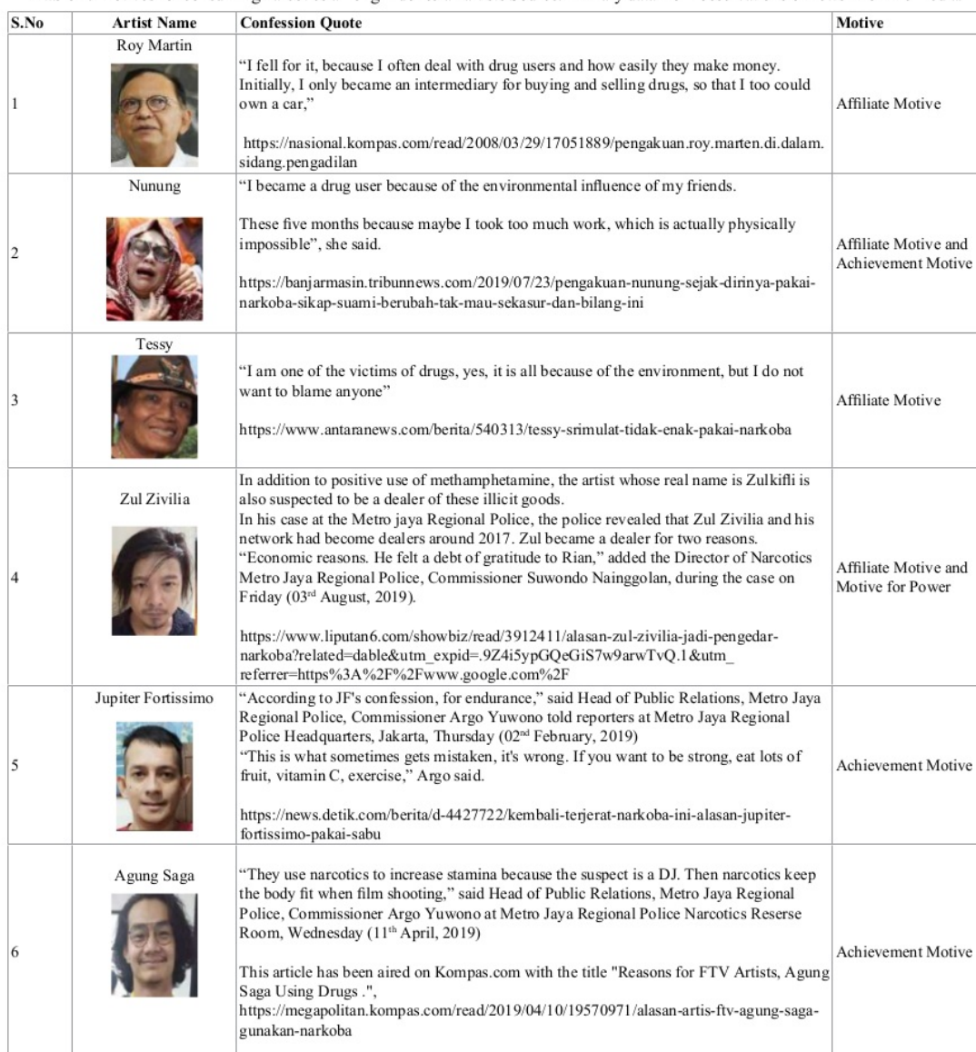
Table 1: Motives for consuming narcotics among Indonesian artists