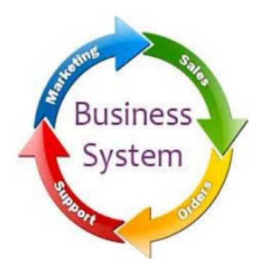
Fig.1: Business system

business will generally leave you feeling a small amount overcome. The area unit your own personal goals area unit you continue to inquisitive the way to realize the life-style you unreal of once you commenced to become a business owner? You recognize the area units things to be done, however you are not certain wherever to start.