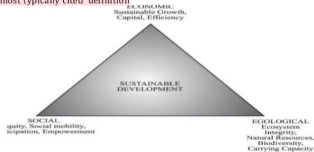
1 Fig. 2: Triangle of Sustainable Development

1 SUSTAINABLE DEVELOPMENT Although property development is outlined in multiple ways that, the foremost typically cited definition