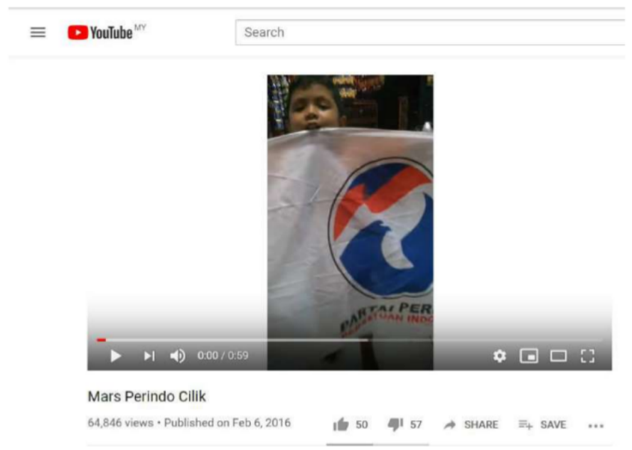
Figure 1: Children singing Perindo Mars

Later saw the emergence of videos on YouTube and social media, containing elementary school children who sang Perindo Mars (Purbasari, 2016) as in Figure 1.