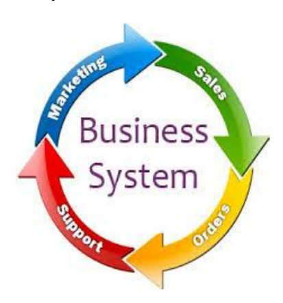
Fig.1: Business system

business will generally leave you feeling a small amount overcome. The area unit your own personal goals area unit you continue to inquisitive the way to realize the life-style you unreal of once you commenced to become a business owner? You recognize the area units things to be done, however you are not certain wherever to start.