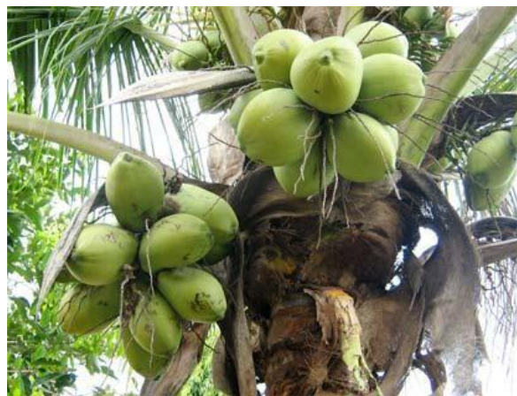
Figure 1. Pohon Kelapa

The figure below is a coconut tree which has the potential to be developed as a finishing product, crafts, and home appliances.