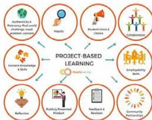
Figure 1, Project Based Learning

In Figure 1, the implementation of project-based learning cannot be fully realized in online learning. Learning in the future Covid 19 certainly requires adjustments in the implementation of project-based learning, due to the application of the Minister of Education and Culture No. 4 of 2020 makes teachers and students can not meet directly to lead the learning process. Project-based learning is generally done in groups or in collaboration with students, but during a pandemic, collaboration can be established between students and parents to involve teachers, students and parents. The implementation of project-based learning during the Covid 19 pandemic was achieved by choosing the right media because learning was not done face-to-face but was carried out using distance learning methods. Implementation of learning at home namely distance learning emphasizes the concept of learning by using means that allow interaction between teachers and students, not creating new costs because the learning conditions that occur are not normal conditions.