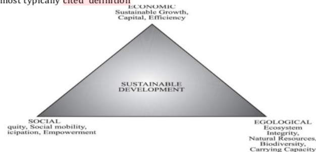
Fig. 2: Triangle of Sustainable Development

Although property development is outlined in multiple ways that, the foremost typically cited definition