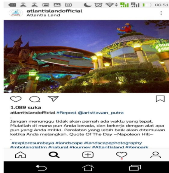
Figure 1: Instagram of Atlantis Land Official

Instagram aimed at promoting a worthy cause can lead to a higher good. Sharing event images and videos can help followers feel like they're in the action and are a real part of the community. Hashtags used by PT. Granting Jaya as an effective tool to make the name of Atlantis Land Surabaya become more viral and famous as a current issue in the city of Surabaya, especially In the tourism sector.