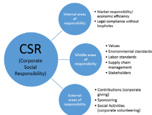
7 Figure1. Corporate Social Responsibility

Corporate Social responsibility in latest years and it is currently appeared to be at its most prevailing representing an essential subject matter for evaluation. Numerous college students rectangular degree of the examine that Corporate Social responsibility is generally related to criminal and social norms anywhere few disagree profession it a photo building device. on the opposite hand, there may be speculation if it is accomplice in nursing motion on the a long way aspect criminal sanctions generally called voluntarism need to qualify as socially accountable action. To recognize and examine theTheory of corporate Social responsibility, three phrases square measure to be rigorously understood. Those are company social and responsible. to difficult it, corporate Social responsibility refers to the obligations companies have towards society a part of that they exist, what's more the position of corporate Social responsibility lies on the some distance facet these limitations. Corporate Social responsibility is liked otherwise through definitely distinctive people.