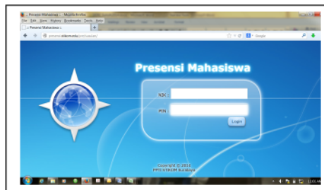
Figure 1. An example of display from software used in learning

Based on those characteristics, the learning on an action conception requires software. Those softwares are used in learning basic concepts in logic and algorithms. They are variable, constanta, data, a variety of otomation process, input and output design. The students are requested to run it and observe each changing that occurs. The following figure is an example of display from software used in learning.