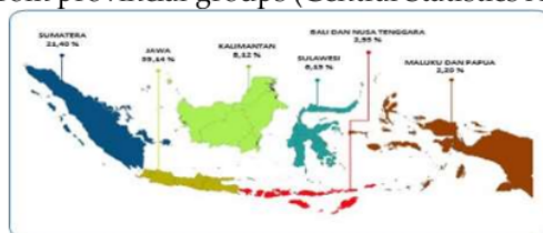
Figure 2. The Role of Islands in the Formation of National GDP in the First Quarter of 2020 (Percent)

contribution from provincial groups (Central Statistics Agency).