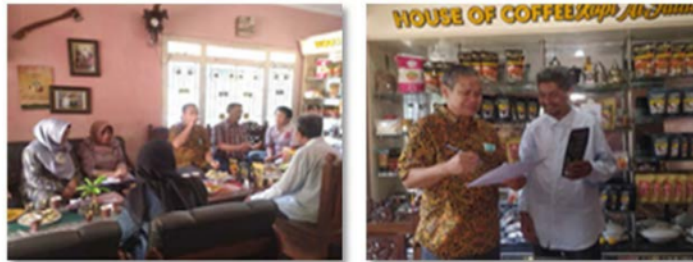
Figure 2. Digital marketing concept education

On Friday, August 19th, 2022, the partner was educated to understand the concept of digital marketing by the PKM team as seen in Figure 2. This education is a form of knowledge transfer that is expected to increase the partner's motivation and commitment to implementing the concept of digital marketing in their business.