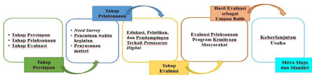
Figure 1. The stages of implementing the community partnership program