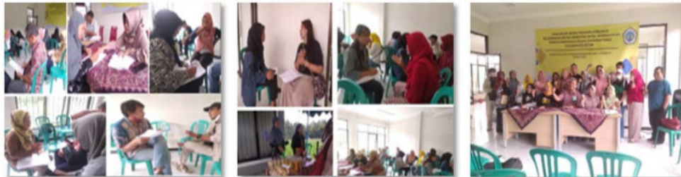
Figure 6. Evaluation stage of with in-depth interviews with partners Figure 7. The community service team with partners after the evaluation stage

One of the results that need to be seen in the activities of this community partnership program is the evaluation stage. After the mentoring activities for utilizing digital marketing were completed, the PKM team evaluated the success of the behaviors of the spice coffee SMEs that participated in this activity. The results of this evaluation are expected to be used as indicators in implementing the same activities at other times. The evaluation stage for the implementation of the Community Partnership Program will be carried out on Sunday, September 11, 2022 by conducting a survey with in-depth interviews with partners who have participated in this PKM activity as shown in Figures 6 and 7.