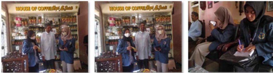
Figure 4. Assistance in creating social media accounts and content

As a community service team and assisted by a team of students, they have provided successful tricks for implementing digital marketing and increasing interaction on social media. Partners who before the implementation of this community partnership program did not have social media accounts, for this reason on Sunday, August 21, 2022 through this Community Partnership program, assistance activities were carried out in creating social media accounts as shown in Figure 4.