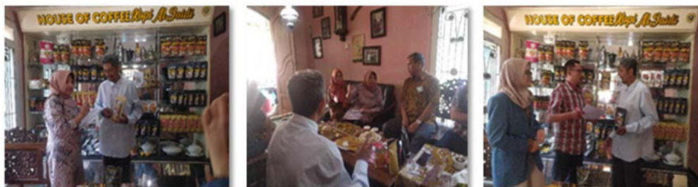
Figure 3. Digital marketing training

On Saturday, 20 August 2022, through the Community Partnership Program, digital marketing training activities were carried out for partners by the PKM Team as shown in Figure 3. This training is a form of knowledge transfer which results in increased insight and knowledge of partners about digital marketing. Apart from that, as a result of the skill transfer process, partners have also improved their skills in managing social media accounts to boost sales. This is in accordance with previous research which concluded that social media is a very effective marketing communication medium, can increase consumer interest in the brands offered, so that ultimately can increase sales (Uitz, 2012). Partners have been trained on how to create accounts and upload content on social media and how to create content in the form of photos and videos that are creative and attract attention.